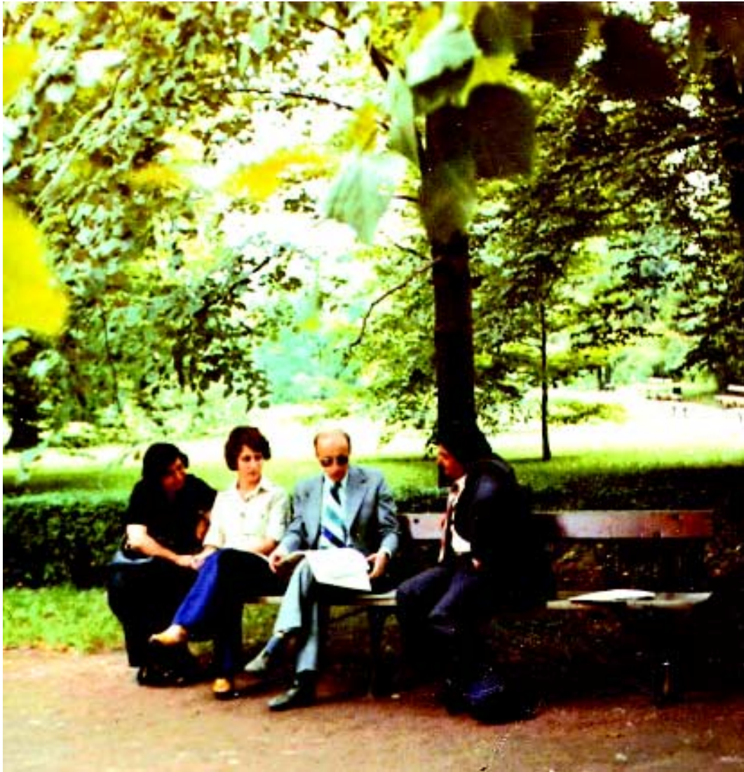
Fot. 3. Szkolenie personelu irackiego odbywało się nawet w Łazienkach. Zdjęcie ze zbioru autora, 1976